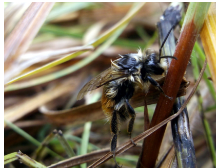
Insect or Arachnid