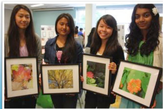
2014 School-Based Bondar Challenge Winners

Teachers will have the opportunity to submit students' submissions at the end of the Fall and Spring semesters.